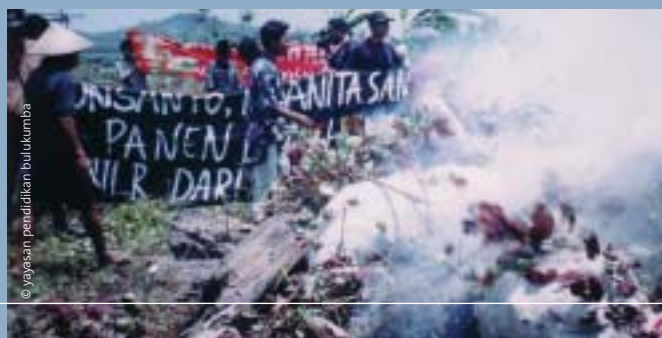
Farmers in South Sulawesi, Indonesia burning GM cotton in September 2001.

Monsanto's June 2005 property rights claim over soy cake from Argentina signals that the company believes that it has proprietary rights over transgenes not only in its patented seeds but in products derived from these seeds. This is a strong warning of the risks involved in allowing a multi-billion dollar company to continuously expand its crop model. In order to obtain what it considers 'adequate' benefits, Monsanto will need to progressively increase its control over the seed, food, and feed supply of any country in which its products are introduced, to the detriment of the nation's farmers.