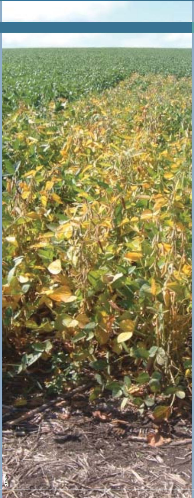
Soy in South America.

The introduction of GM crops has been dominated and promoted by a handful of corporations. Three companies - Monsanto, Syngenta, and Bayer – are responsible for virtually all of the commercially released GM crops in the world today.